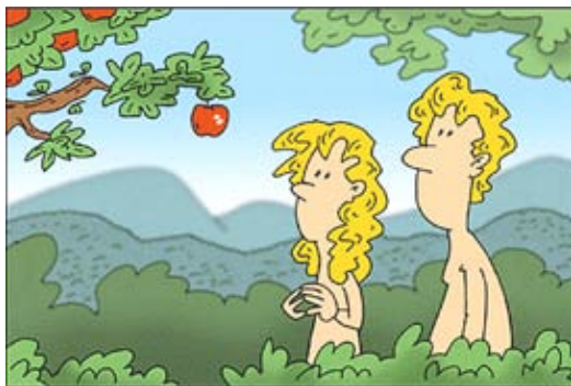
(See Genesis 3) ..AND ON THE EIGHTH DAY, MAN CREATED SIN 09-06-2010

Jesus counters this self-righteousness with three parables. They illustrate the joy brought by conversion.